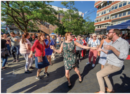
A royal celebration – Orpington’s marking Queen Elizabeth’s Platinum Jubilee in Market Square