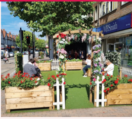
High street parklets provided additional seating as well as extra greening, creating a more welcoming environment