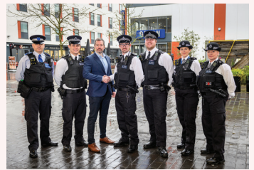
Following persistent lobbying from the BID, the Safer Neighbourhood Team for the Orpington Ward was increased to seven active officers