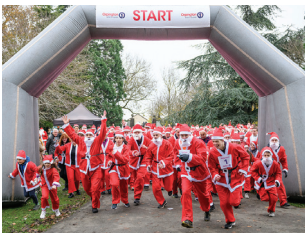
Orpington Santa Dash 2022 saw the town painted red by record numbers of all ages and abilities

Along with Christmas lights over the festive period, Orpington 1st's summer planting programme is part of the BID's drive to improve the Look & Feel of the town centre