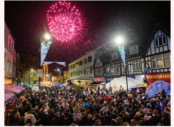
Orpington’s Christmas extravaganza saw the town light up with festive spirit

We continued to lobby on behalf of businesses and in January 2023 we welcomed an uplift in the Met Police Orpington Safer Neighbourhood Team . Ahead of the Spring budget, the BID organised a roundtable discussion between Gareth Bacon MP and a cross section of local business leaders to discuss challenges and opportunities. Orpington 1st will continue to ensure that the voice of local business is heard.