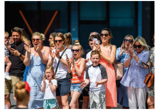
As part of our event programme, we introduced a new literary festival celebrating the written and spoken word with a mixture of online and in-person events

2021 was another challenging year but Orpington's business community continued to demonstrate its resilience and agility through the covid-19 pandemic. The BID refocused activity to support town centre businesses through the crisis whilst still delivering customer focused activity to help build back confidence and encourage footfall.