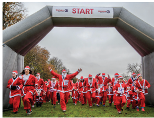
The Orpington Santa Dash returned in 2021 bringing hundreds of Santa and their families to the town centre

The BID was renewed for a second five-year term in November 2017 following a ballot of all eligible businesses, who voted 83% in favour. The BID's role is to deliver the projects set out in the BID