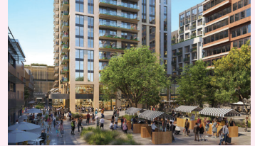
The BID provides a strong voice for business and will continue to work with the council and developers to realise opportunities and mitigate disruption

Orpington 1st's annual food festival promoted our thriving hospitality sector, and alongside the Orpington Santa Dash we delivered the town's first ice rink offering almost 6,000 places to residents during the important Christmas trading period.