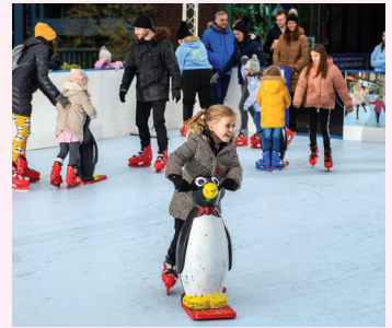
The Orpington Ice Rink welcomed residents to the town throughout December