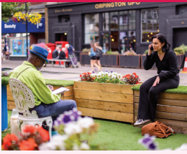
Our High Street Pallet Park created more greening, planting and seating, and provided an additional location for activities - like our caricaturist