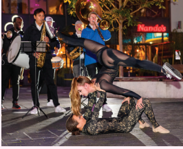
Our roaming performers entertained high street diners for our food festival

As the pandemic continued to impact on businesses Orpington 1st worked in partnership with LBB to ensure our businesses had access to all available grant schemes , providing advice on eligibility and support with applications.